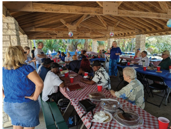
Candidates were given the opportunity to speak.