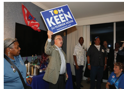
DVCF Sponsor and endorsed candidate speaks.